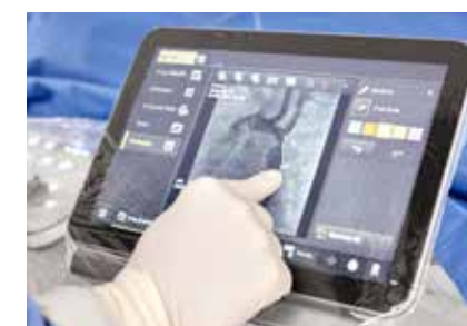
Touch screen module Pro

The standard Windows 10 platform can help support compliance with the latest security and standards to protect patient data. It can also accommodate new software options to extend your system's clinical relevance over time.